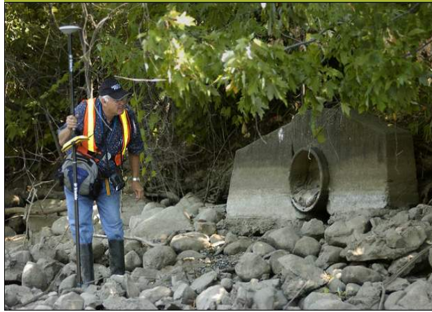
City of Lansing IDEP on the Grand River - Draw Down