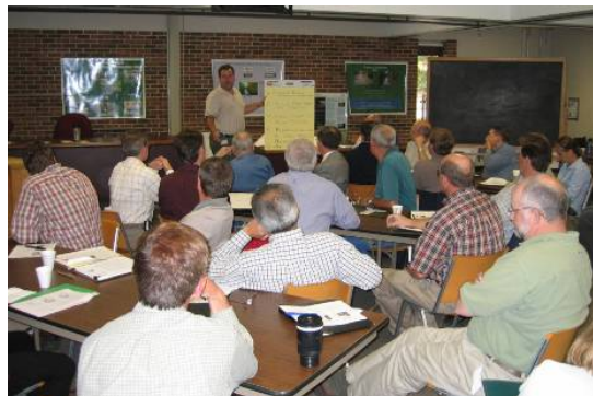
Red Cedar Stakeholder Workshop

GLRC members have been provided with a template report providing details of the last three years worth of work by the implementation committees. A significant number of action plan items have been completed and are being implemented on a regular basis. If you have any questions while completing the report, please contact Erin Campbell at 394-0342.