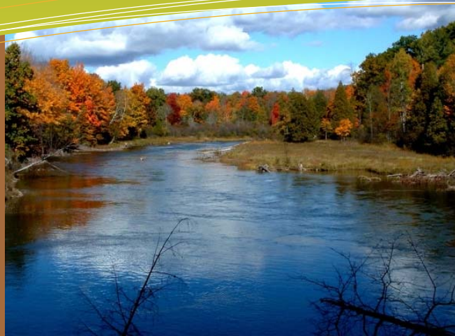
Grand River, Michigan