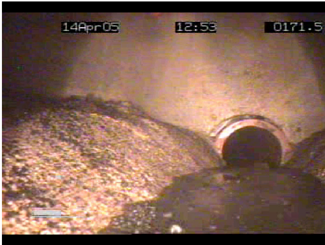
Typical sewer manhole.